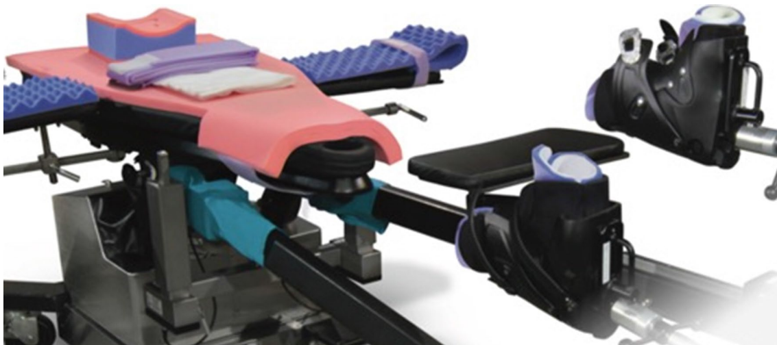
Fig. 1 Shape-conforming hip positioning pad system was used to obtain an adequate distraction of the femoral fracture in the postless group

The following data were collected for all patients: age, gender, weight, diagnoses (fractures were classified according to the 2018 revision of AO classification) [8], type and size of nail, surgical timing, Trendelenburg angles during surgery, and quality of reduction according to Baumgaertner classification for subtrochanteric