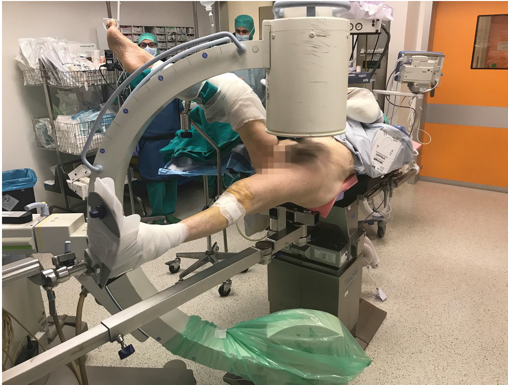
Fig. 3 Patient's positioning for the postless traction technique

One patient in the control group had a failure of the fixation, and one patient in the postless group had a deep infection.