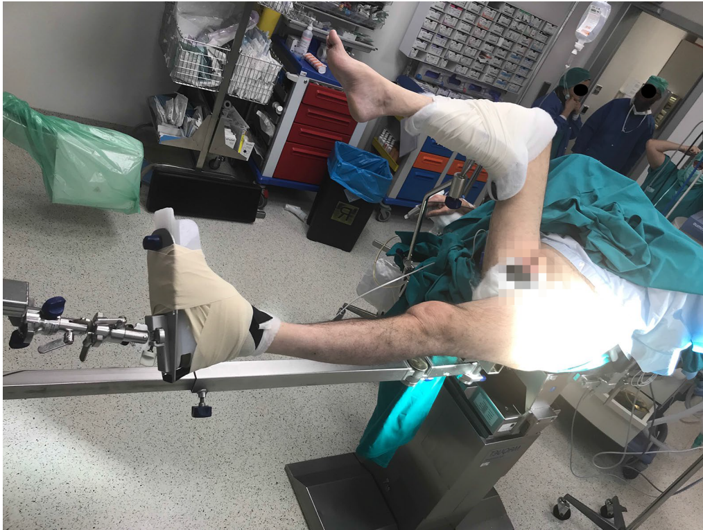
Fig. 2 Patient's positioning on the standard traction table with a perineal post

fracture [9, 10] and according to Thoresen classification for femoral shaft fracture [11]. Patients were interviewed at 6 months; the control group was evaluated as part of the outcome of a previous study, while the study group was interviewed to evaluate the outcome of the postless technique.