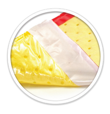
Residue-free adhesive allows for easy application and re-positioning