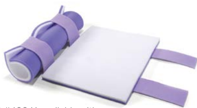
Kit #40641 available with One-Step Arm Protectors