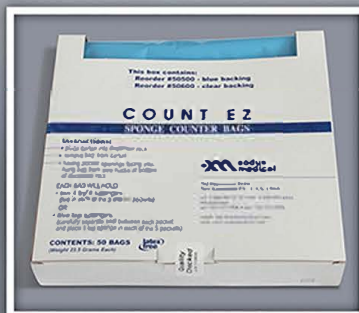
Product #50500 Blue Backing 5 boxes of 50 bags (250 bags per case)