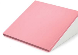
40499 PinkProtect Prone Wedge 4/case - 19.25" x 18" x 7"