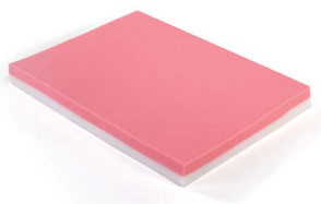
40771 Large Dual Layer Pad 24/case - 15" x 11" x 1"