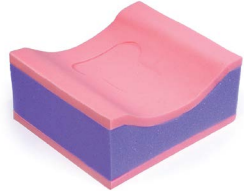
40519 Supine Headrest 16/case - 8" x 9" x 4"