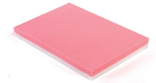
40772 Standard Dual Layer Pad 48/case - 8" x 11" x 1"