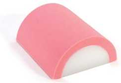
40544 Pink Arcs (standard) 16/case - 9" x 8" x 4"