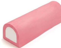
40545 Pink Arcs (large) 6/case - 16" x 6" x 6"