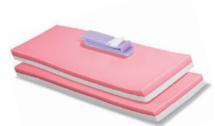
40547 Dual Layer Arm Board Pads 8 Pairs with straps /case - 28.75" x 7.8" x 1.5"