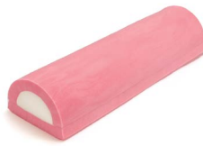
40524 Pink Arcs (medium) 8/case - 16" x 6" x 4"