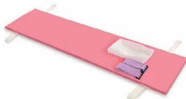
40600 Pink Pad EXT™ 2/case - 72" x 20" x 1"