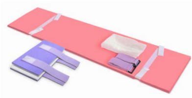
40602 Pink Pad EXT™ w/ Arm Protectors 2/case - 72" x 20" x 1"